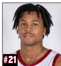
D.J. WAGNER Communications