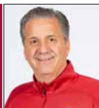
John CALIPARI Head Coach