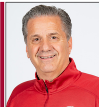
John CALIPARI Head Coach