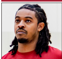
Tyler ULIS Basketball Assistant