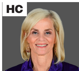
Kim Mulkey Tangipahoa Parish, La.