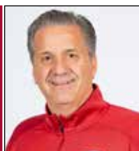
John CALIPARI Head Coach