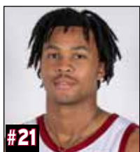
D.J. WAGNER Communications