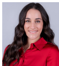
JORDYN WIEBER HEAD COACH